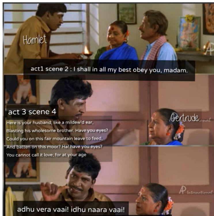
FIGURE 1. MEME 1

Meme 1 is adapted from a Tamil movie to discuss the shift in the character of Hamlet. The character in the movie is introduced as a very obedient and respectable son, who leaves for work only after worshipping his parents in the morning. He even kisses his parents' feet. But when the scene shifts to evening, he is actually a drunkard who abuses his parents verbally and physically. The alcohol completely changes his behavior only in the evening. When his mother asks how he could utter such from the same mouth that worshiped them in the morning, he replies with his most celebrated dialogue, "That mouth praises! This mouth curses!"