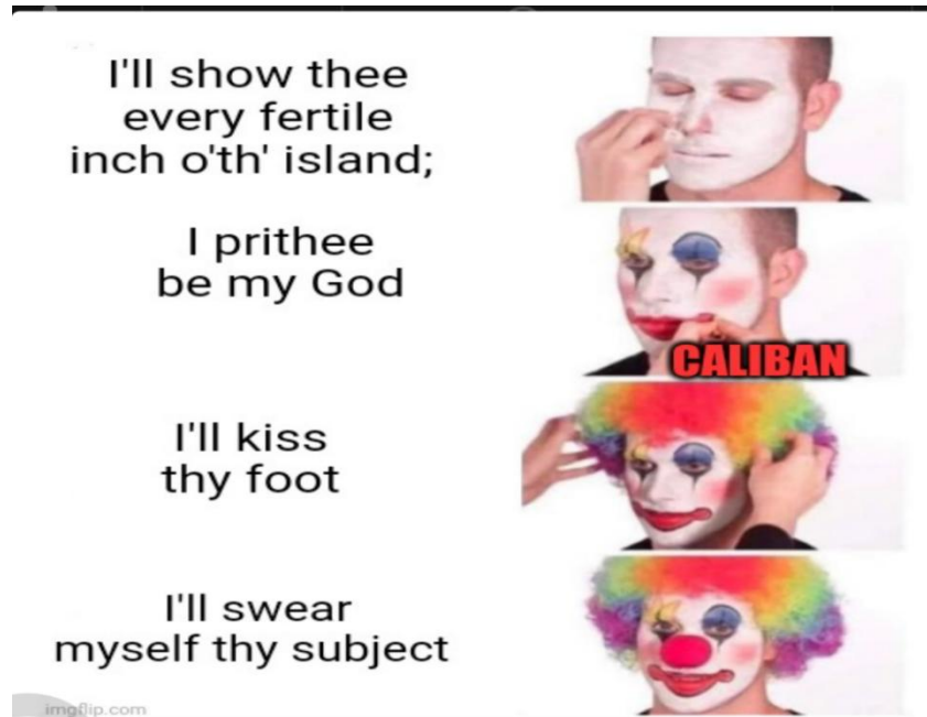
FIGURE 5. MEME 5

Meme 5 shows a clown getting ready, step by step, to make a fool out of himself. When this image is connected with Caliban from 'The Tempest' boasting about the richness of his land takes on a deeper meaning of colonization, subjugation, and slavery—simply put, 'Digging one's own grave'. Caliban has been a slave of Prospero for years. Being the only native of the island, Caliban always wanted freedom for himself and his land. In context, Caliban has only just tasted liquor for the first time, and is paying lip service to Trinculo in order to get more. A valid modern interpretation involves having Caliban played by an indigenous person. This interpretation highlights the dangers of the introducing liquor to unsuspecting native populations and at the same time insinuates that Caliban is the rightful guardian of the island while Prospero is the usurper. The concept of slavery has been ingrained in his mind due to years of exposure to it. Therefore, he unconsciously surrenders himself even to new visitors, once again digging his own grave as a slave, but this time under new masters. In this context, the mind is colonized, and to support this argument, Ngugi Wa Thiong'o's book 'Decolonising the Mind' can be introduced in class.