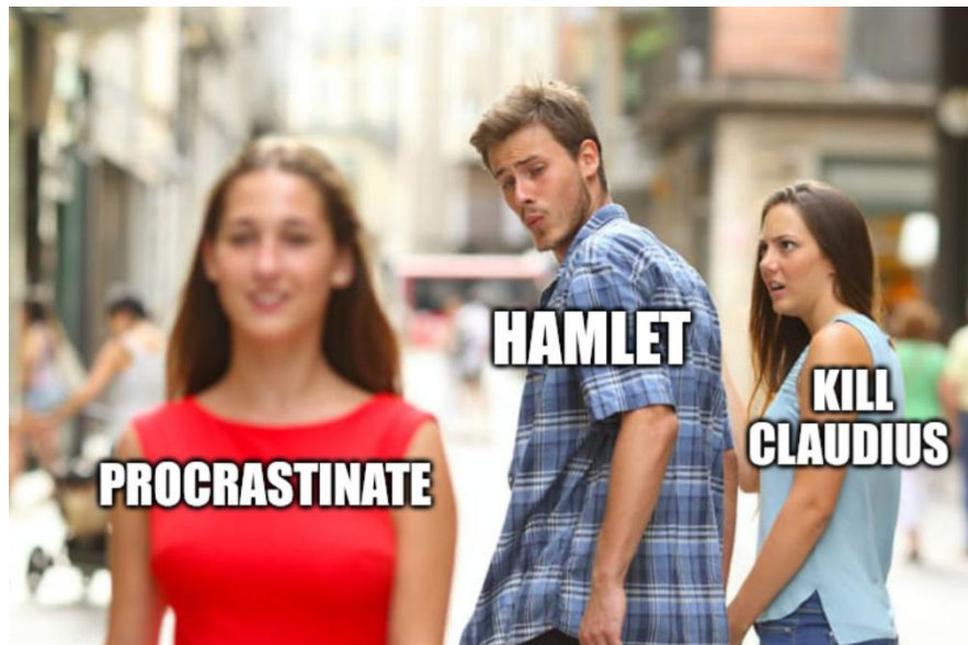
FIGURE 2. MEME 2